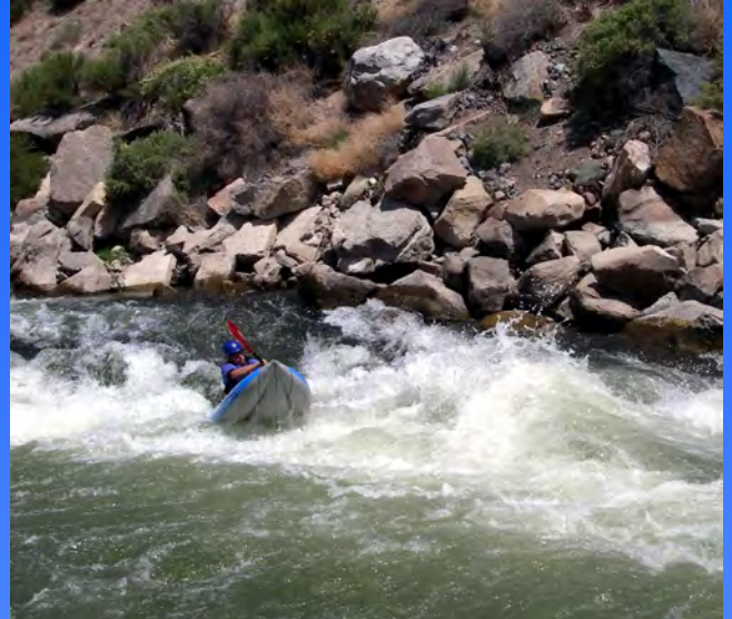
Joe Galeazzi - running Tin Cup Rapids (Class III) on the Rincon section of the Arkansas River, Colorado