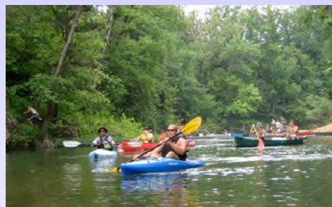
Don't go on a weekend!