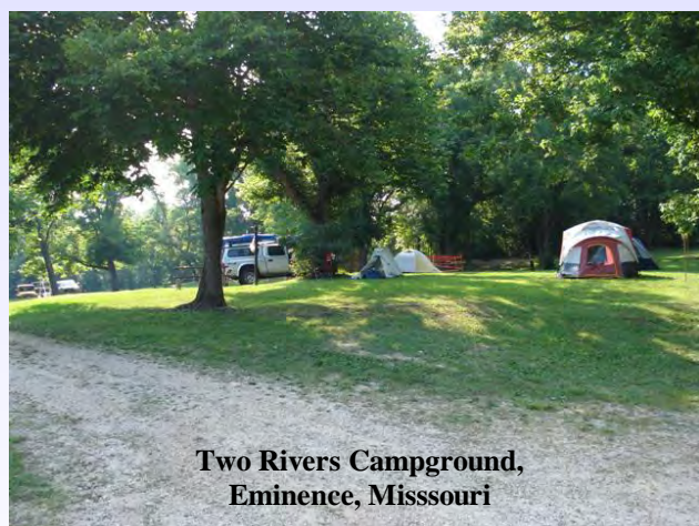
Two Rivers Campground, Eminence, Missouri

Our first float went from Round Springs back to the campground. The trip was 18 river miles. We were able to find some nice campers who rode with us to Round Springs and drove our vehicle back to the campground, at no charge! The float was great. Few people on the water, good flow, warm weather. The only downside was the motorboat traffic.