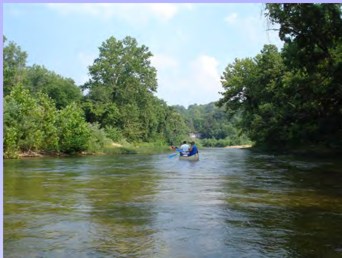
Current River, approaching the confluence of the Jack's Fork River near Two Rivers campground.

Camping fees were $8.00 per night per campsite. Be warned, the tightly packed campgrounds are pretty noisy at night.