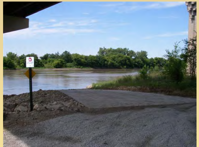
New 177 bridge river access and boat ramp

The KCKA 2008 Fall Rendezvous/Kansas River Float Trip will be held in Manhattan, KS. Please RSVP. This will also be the Riley County new Public Boat Ramp & Kansas River Access dedication. Mark your calendars. Special Guests: Riley County Commission, Manhattan City Commission, State Representatives, State Senate, Chamber of Commerce, KDWP officials, Kansas Canoe & Kayak Association, local media, others.