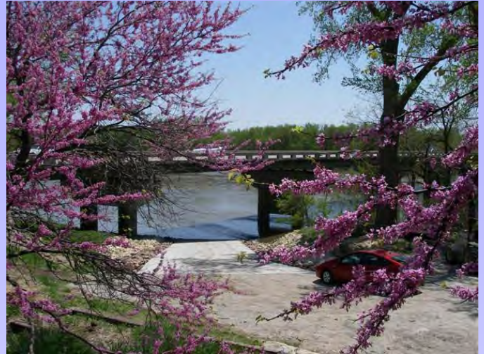
Looking downstream at the new River Front Park access

KCKA has donated $500 to help complete the new Kansas River Access at Wamego's River Front Park. The contribution was given in the name of KCKA and was used to pay for additional gravels, seeding, and plants. Money came from the General Fund, the Conservation and Access fund, and the Kayak Chapter.